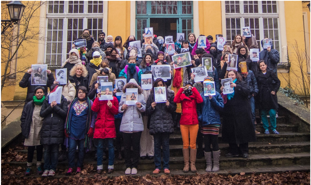
Figure 1: Picture of GTI participants

The aims of the institute were to train participants in order to learn tools and techniques for increasing their understanding and practice in digital security and privacy and in order to become digital security trainers and privacy advocates within their own organisations and communities. The Institute was also intended to better understand what could be new approaches to privacy and digital security including a gender and cultural diversity approach. Contents addressed encompassed theoretical elements dealing with gender and technology, privacy and surveillance, training skills and practical tips and methodologies to become an outstanding privacy advocate or digital security trainer. Other dimensions, such as holistic security, self care, risk analysis, tackling online violence, develop feminist principles of the internet were also discussed along the encounter.