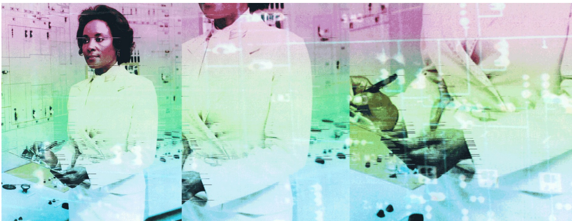
Figure 12: Banner of the FemHack website