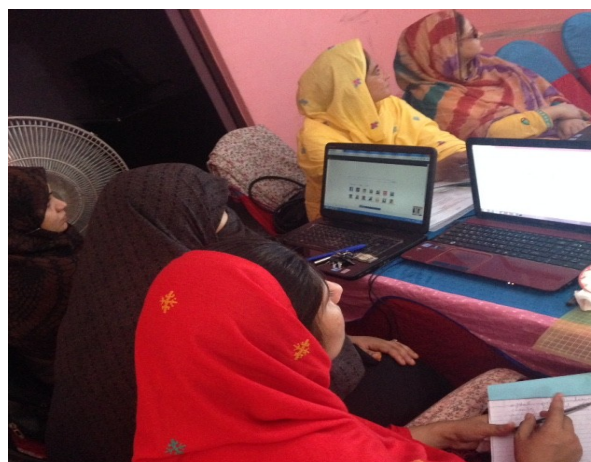
Figures 9 and 10: Pictures taken during Hamara internet workshops