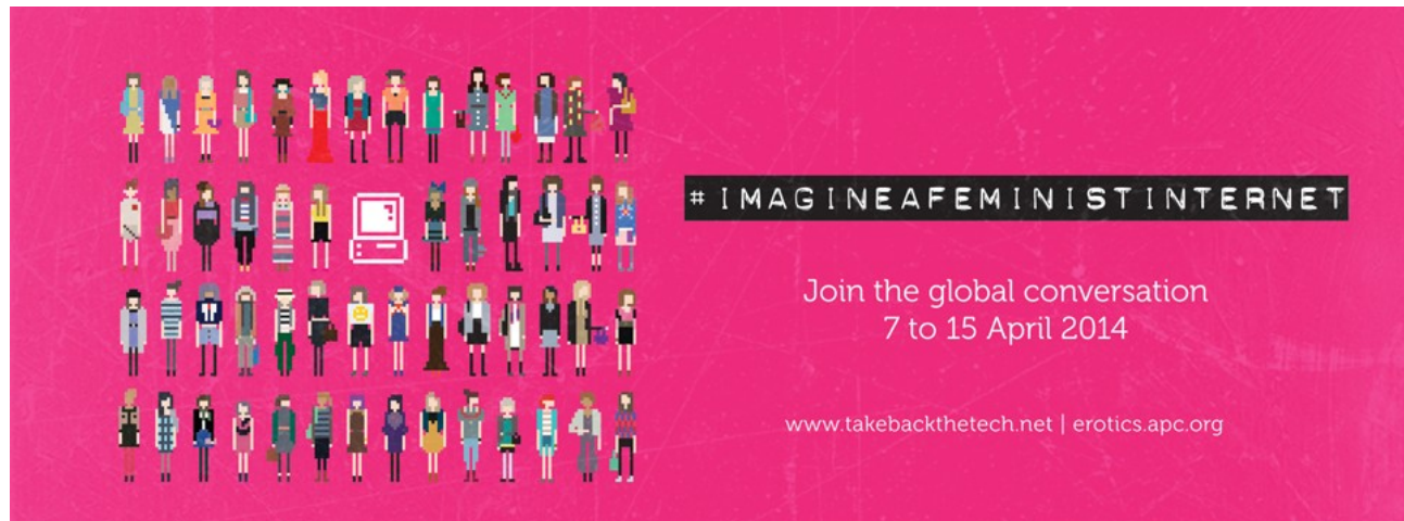
Figure 3: Imagine a Feminist Internet by APC Women Program

violence. Those creative solutions also depends of careful planning for creating partnerships, synergies and networking among organisations that have been for working on gender based online violence, how to research, document and overcome it. Accordingly, this project is also informed by the advocacy of groups like APC and others, who are working to reframe internet rights as human rights.