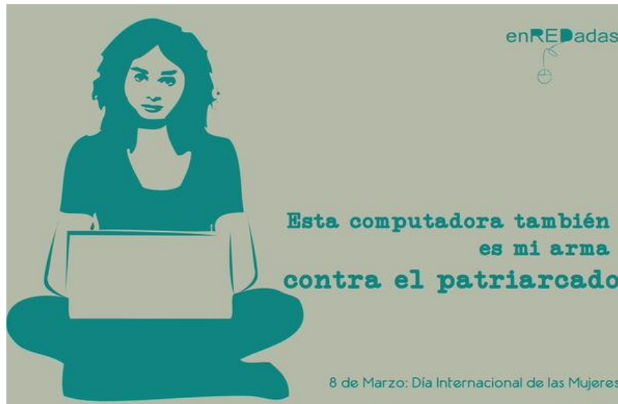
Figure 2: Picture of Enredadas, an initiative of one GTI participant

All together, through this project we also discovered that enabling enthusiasm for privacy and digital security practices required an integrated approach linking those to our well-being and physical security as human right defenders and feminist and queer activists. By exposing the many invisible contributions that sustain digital security communities, avoiding frustrated expectations, gaining self confidence and losing fear through do-it-with-others processes, gender and cultural diversity in those fields can be included. Accordingly, adapted, updated and targeted resources and training methodologies focusing on specific threats and strengths is required in order to activate curiosity and better understanding through contextual references.