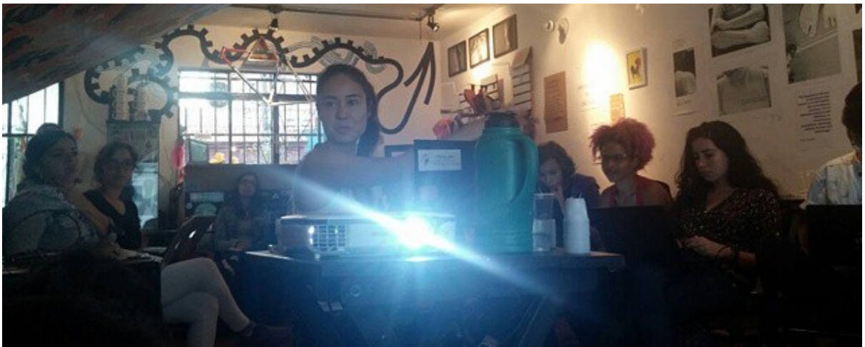
Figure 5: A digital security training for feminists organised by a GTI participant

"We have the will to build something, like the hacklab for instance, we want a space that women, non binary and trans can come in. A GTI in Brazil would help to achieve those objectives" (F.S)