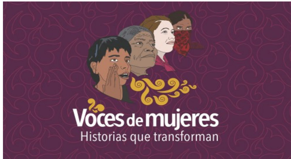
Figure 6: Project coordinated by one GTI participant

(anti mining, environmentalists, social gender justice, LGBTQI rights). It is noteworthy that in general the longer trainings received some type of funding from the organisations enabling their sustainability. On the other hand, many activities lasting less than one day were based on voluntary work or in house trainings provided by GTI participants to their own organisation.