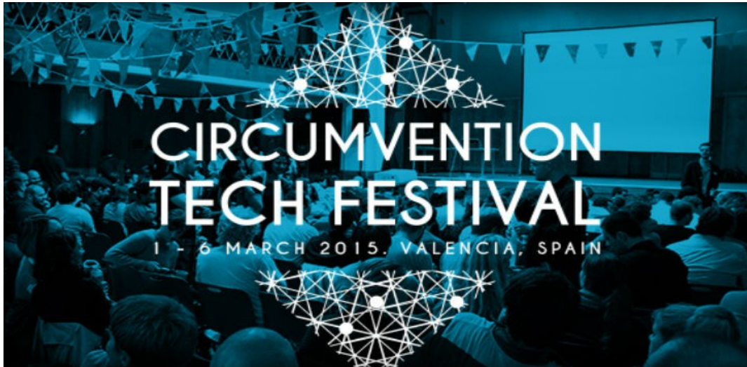
Figure 11: Website of the Circumvention Tech Festival

“For me, attending the Gender and Technology Institute turned to be a very intense experience and I have to admit that it was not until the Circumvention Tech Festival that I could begin to put a name and give voice to the range of emotions the GTI had caused in me. To be nourished with reflections from such a broad diversity and understanding the holistic security approach served me a lot” (M.S)