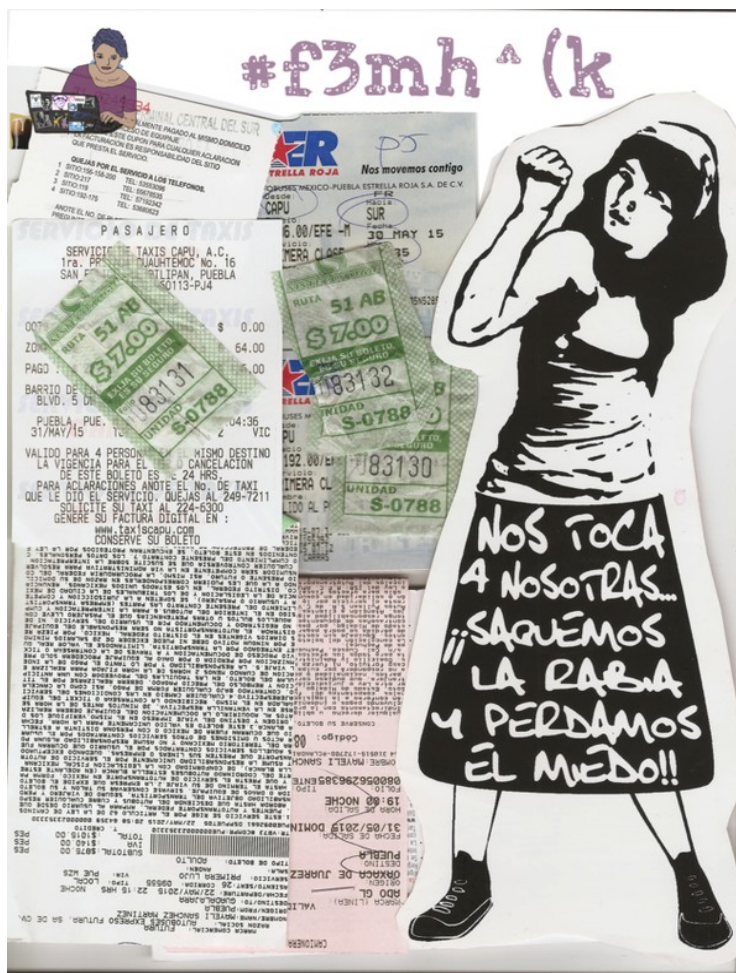
Figure 4: A poster of an activity organised by a GTI participant

"I have met so many women who have gone through cyber bullying and seen the impacts that it has had on their lives. For me training on privacy advocacy and digital security is more than just training it is about sharing critical information that will change the lives of women in online spaces" (Y.R)