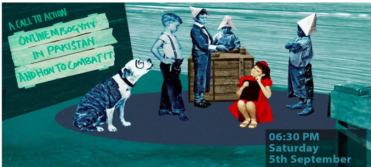
Figure 7: One activity organised by a GTI participant

it comes to older participants, among them was noticed ignorance ways of functioning of the Internet and the dangers that hide behind that, though they include it in their daily lives, both business as well as private. (Serbia)